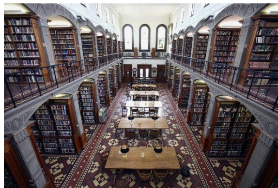
Interior of the Gardner A. Sage Library of the New Brunswick Theological Seminary

The first building of the new seminary campus, Hertzog Hall, was dedicated in 1856, and by 1885 it stood in the middle of an impressive row of structures that faced the college buildings across what is now the Neilson campus of Rutgers but was then mostly still empty ground. All of those nineteenth-century seminary buildings have now been razed, except for one, Gardner L. Sage Library (1875), the remarkable work of the eclectic German-American architect Dietlef Linau, which stands adjacent to the seminary's new and yet unnamed structure at the west end of Seminary Place.